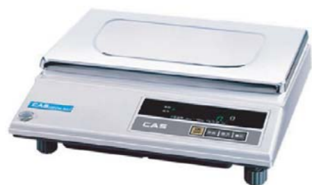
AD-15T Baby Weighing Scale