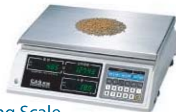
SC Series Counting Scale