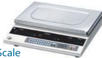
CS Series Counting Scale